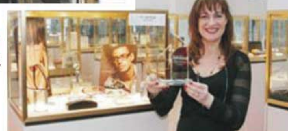
21st anniversary spring show.

International Vision Expo/East has marked its 21st anniversary with an annual Spring show that took place late March in New York City. The show was host to over 600 exhibitors, drawing attendees from around the globe and providing four consecutive days of intense business, fashion and fun. The latest eyewear styles varied from large scale to minimalist, leaning towards square shapes in a full range of sizes. As a fashion accessory, sunglasses boasted elaborate frame designs adorned with lacquers, metals and stones.