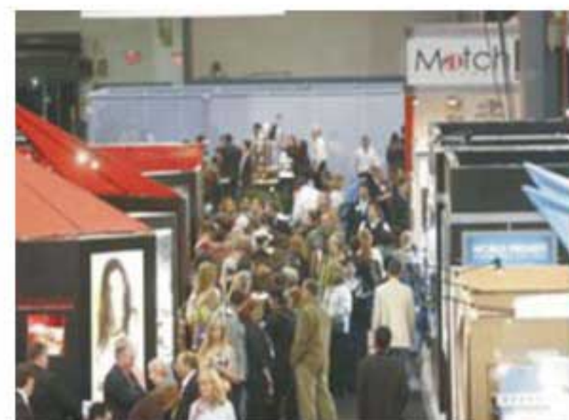
The three major optical houses were well represented.

In order to stay abreast of the developing trends in the visual merchandising industry, Pacific Northern continues to attend a variety of Trade Shows, broadening the perspective and expertise of its Sales and Design Teams.